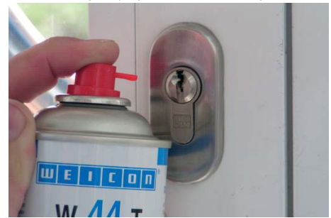
Ensures a perfect function of locks Hält Schlösser gängig