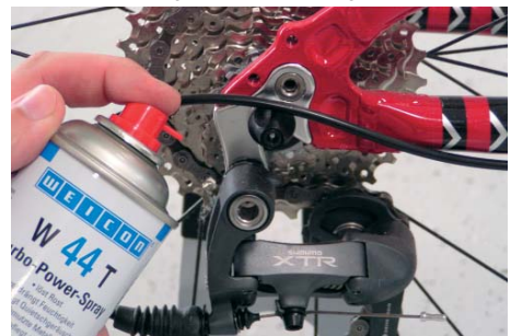
Lubricates moving precision parts Schmiert bewegliche Präzisionsteile