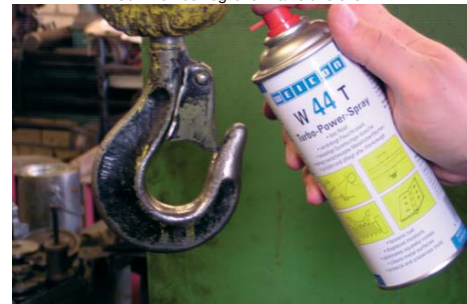
Lubricates and keeps all parts movable (no seizing) Schmiert und hält alle Teile beweglich (kein Festsetzen)

Any product specifications and recommendations given herein must not be seen as guaranteed product characteristics. They are based on our laboratory tests and on practical experience. Since individual application conditions are beyond our knowledge, control and responsibility, this information is provided without any obligation. We do warrant the continuously high quality of our products being free from defects in accordance with and subject to our General Sales Conditions. However, own adequate laboratory and practical tests to find out if the product in question meets the requested properties are recommended. A claim cannot be derived from them. The user bears the only responsibility for non-appropriate or other than specified applications.