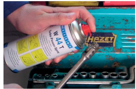
Cleans and preserves all kinds of tools Reinigt und pflegt alle Arten von Werkzeugen